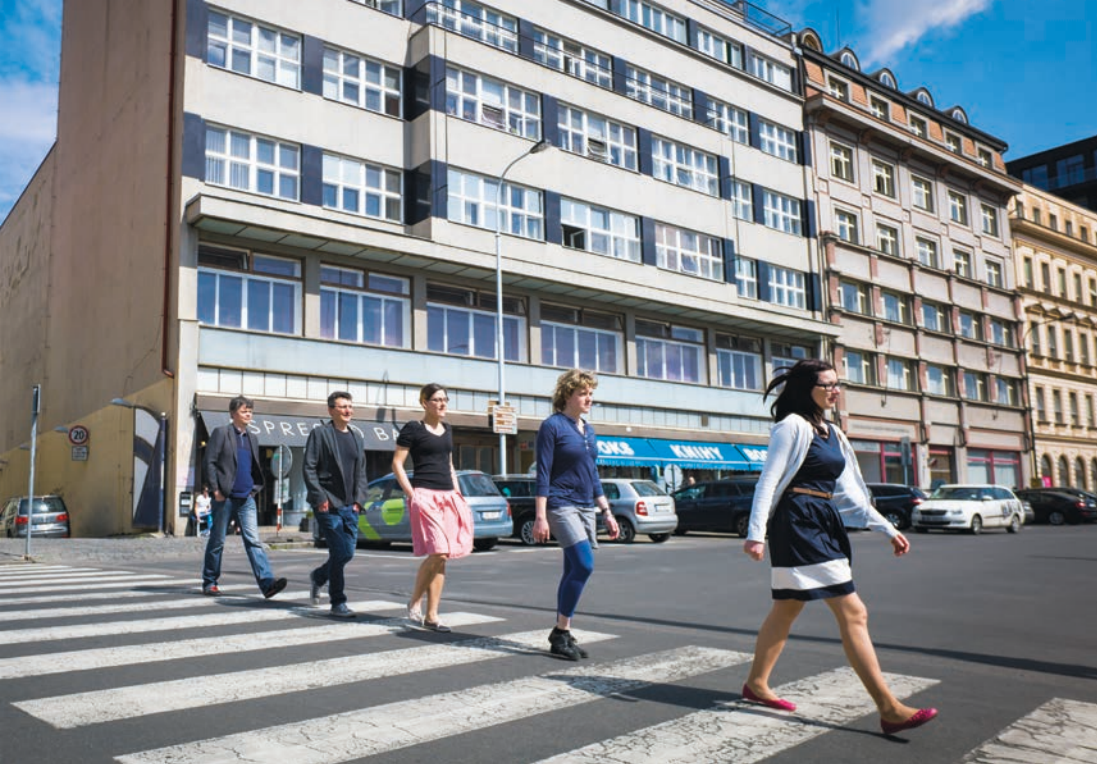
Outside the present-day ICL premises, Na Florenci Street